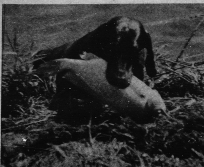
No line, no tackle was needed, just a good grip to land this sheephead at Turkey Point. Jose, a three-year old dachshund repeatedly retrieved the unwanted fish after his master had thrown it back into the water several times.