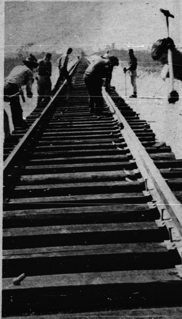
A rail spur line connecting Hydro's new generating plant at Nanticoke, to CNR's main line is currently under construction east of Jarvis. Here rail workers drive spikes as they approach Highway 3.