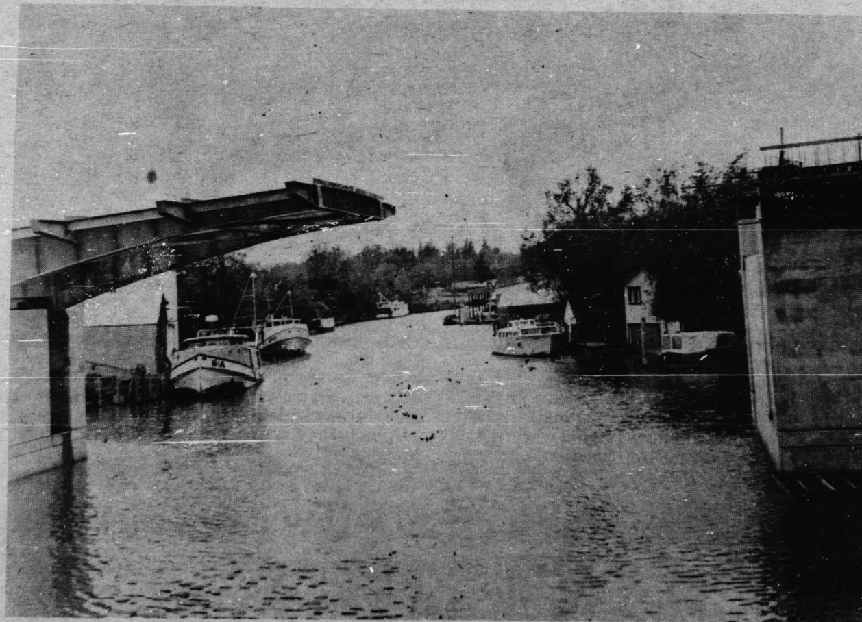
One span up, and one span to go is the situation at the new Pt. Dover lift bridge. The bridge, much higher than the old one, will allow most boats to pass under it allowing highway traffic to continue uninterrupted.