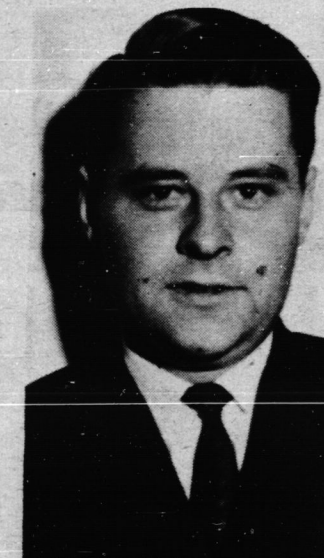
Your Friendly Farm Rep.

Working from fully engineered plans and backed up by the experience of Beaver's Farm Service Department and Engineers the "Farm Rep" is a full time farm building specialist ready to help you plan and build the right building for the job. Phone him direct or contact Beaver Lumber for on-the-farm planning and estimates.