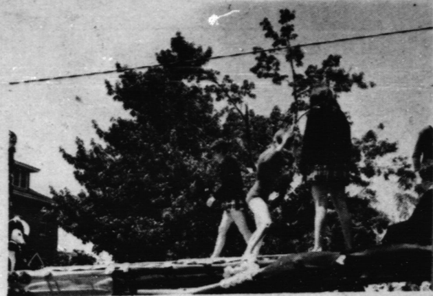
RAH! RAH! - This float caught a lot of attention in the Trade Fair parade in Hagersville on Saturday. This is the Hagersville Secondary School float with the Cheerleaders from the school.