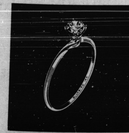
STYLE 861 FROM $100.00