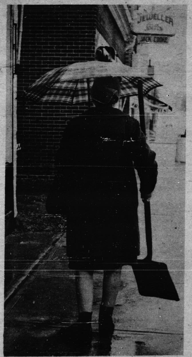
The weather is a fickle thing that's hard to outguess. This woman did though. She is prepared for rain or snow.