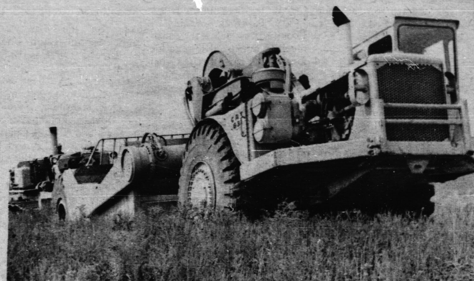
Heavy duty construction equipment roared over acres of ground at the multi million-dollar Stelco Steel Company site this week getting the first visible phase underway.