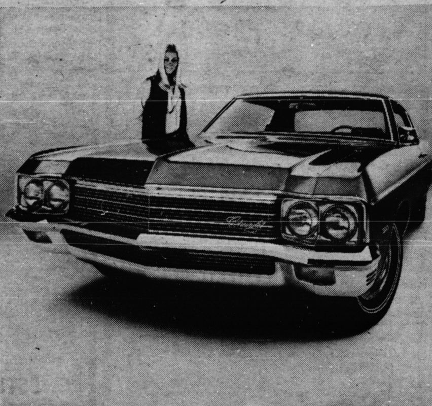
Our big one: Caprice