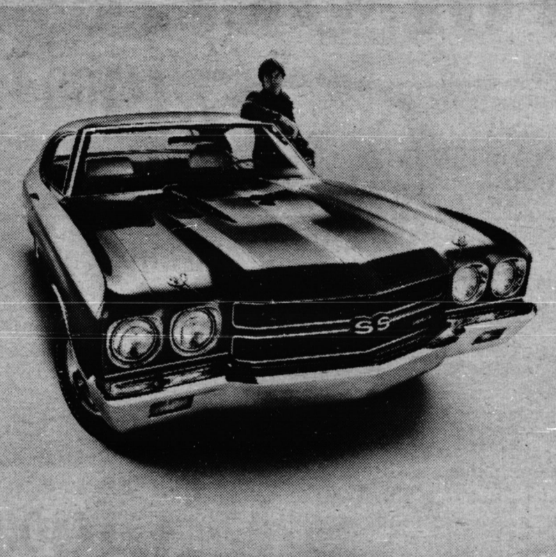
Our tough one: Chevelle SS 396

The Seventies are on the move at your Chevy dealer's right now. So why not get over there for the most moving experience on wheels. Move along and see the new Monte Carlo, Chevrolet's whole new field of one. (At last there's a personal luxury car even us guys who