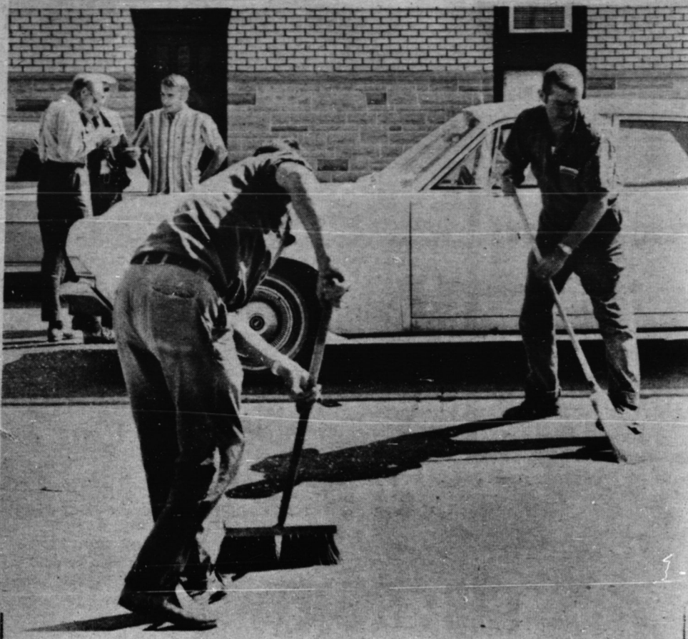
Often glass from an accident remains on the street for days. The debris from this one was cleaned up within minutes by residents here earlier this week.