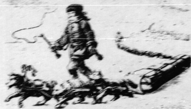
Reindeer never had usefulness equal to dogs, which remained snow-month freight conveyers in Northern Europe and Canada, as illustrated above, into the 20th century.

Yield: 8 Jewelled Holiday Treats One 4 ounce package cream cheese, 1/2 cup crushed pineapple (not drained), 1 tablespoon chopped maraschino cherries, 8 slices enriched white bread. Method: Combine cream cheese, pineapple and cherries. If a "free" cookie cutter is not available, cut each slice of bread in half diagonally. Place one half on top of the other and trim excess from remaining sides. Starting at the right angle