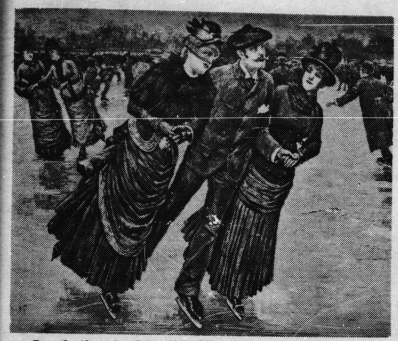
Ice-skating (and hand-holding) were first sports indulged in openly by mingled sexes, married or unmarried, day or night. This scene: Victorian 1890s!

That's why we in the Women's Advisory Committee make a point of urging that Ontario women consider buying Canadian manufactured goods. Trade, of course, is a two-way street, and we don't suggest shopping Canadian for nationalism's sake. Only that Canadian goods and products be considered when price and quality compare favorably with imported items. There are important dividends in shopping Canadian. It helps create jobs, encourages our manufacturers to improve their goods and services, and helps factories reduce their unit costs and export at competitive prices. All these factors enhance our standard of living. And I have no doubt that the illusive "average" Ontario woman will go along with them.