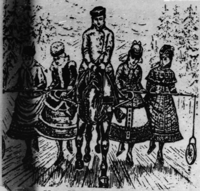
"A New Mode for Learning How to Skate with Rapidity"—an engraving for a popular American periodical in 1874.