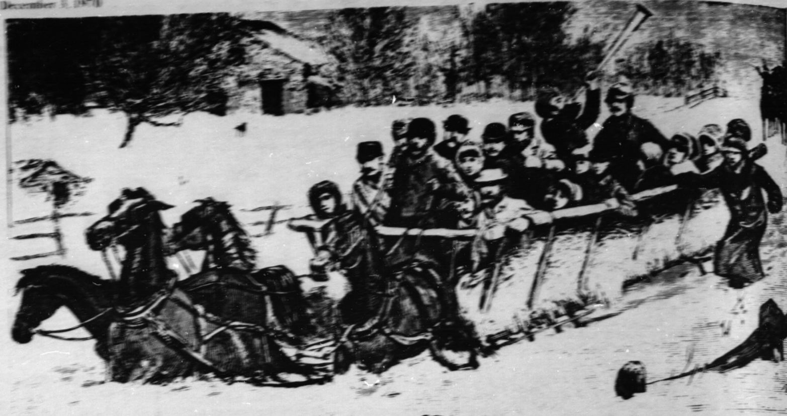
The sleigh ride was cold month equivalent of hay-ride for lively spirits in olden times, with progress heralded resoundingly by horn, and chaparrones following (extreme right) discreetly.

But better than these: When the great lakes freeze: By the clear sharp light Of a starry night. Over the ice spinning With a long free sweep, Of sitting and rising, Forward we sweep! On round and around, With a sharp clear sound, So fly like a fish in the sea! Ah this is the sport for me! Wild free sails on skates were enjoyed from early times in Scandinavian countries, where hunters of game, ducks and other quarry resorted to this swift means of locomotion over the covered waters in frigid season. Then for the most venturesome, solitary, there was sliding through the ice of ponds, small streams, rivers, lakes, rivers in the warm comfort of suits pitched over a hole chipped in the ice.