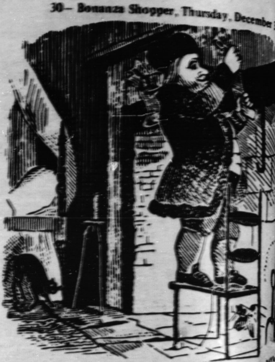
Illustration, attributed to John Boyd, in a publication of "A Visit from St. Nicholas"