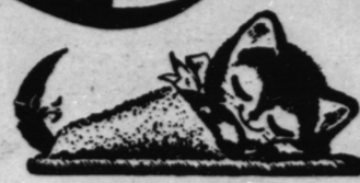
CUDDLE HER FEET IN COMFORT