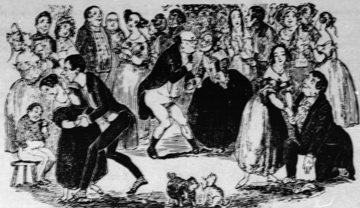
Hablot Knight Brown was another artist discovered by readers of Dickens' fiction through "Pickwick Papers" and such Christmas illustrations as this