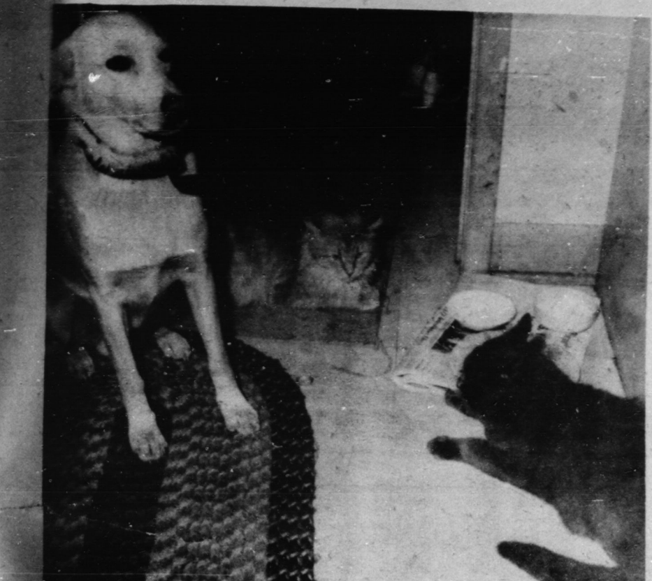
Dinner is served but who will dare to be first? Not me said the dog. We are not just sure either said the cats.