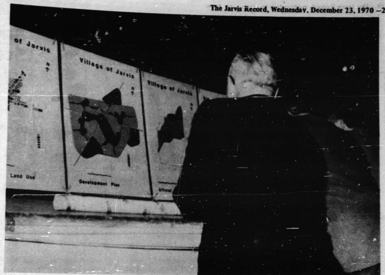
Residents of Jarvis study maps of official plan, which was presented at the Community Centre Thursday.