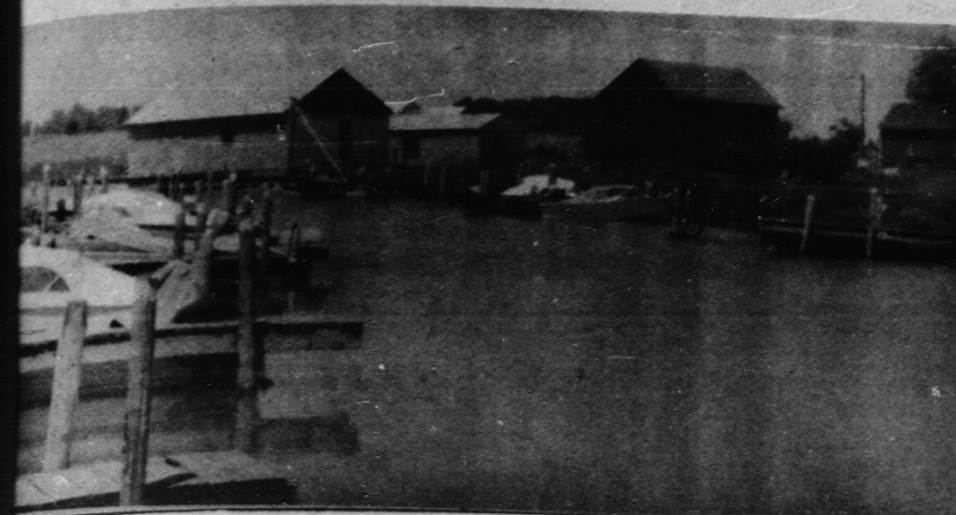
Hoovers Marina at Nanticoke, Ontario.

Anyone may send in nominations by writing to The White Owl Conservation Award, Suite 1501, 550 Sherbrooke Street West, Montreal 111, Quebec.