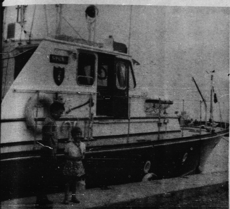
Two small fry looking over the Coast Guard Boat at Port Dover.