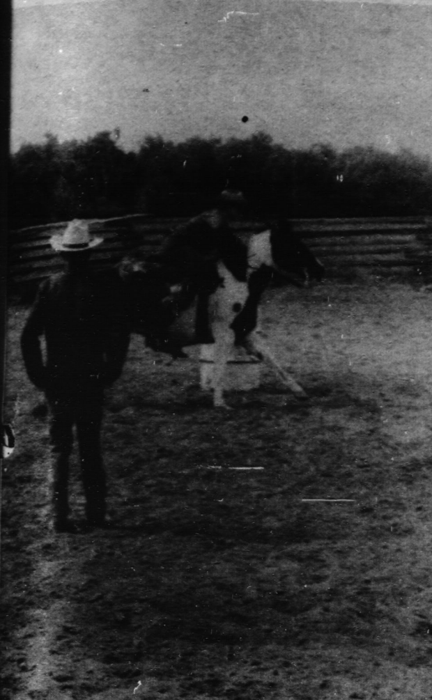
Shown is one of the horses going through its paces at the horse show on Sunday.