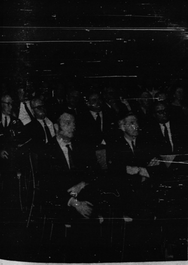
Some 300 people attended a joint meeting of the local municipal authorities, planning groups, members of the Haldimand-Norfolk study committee and Ontario officials. Part of the crowd is shown listening to the phase 1 portion of a proposed plan for the area.