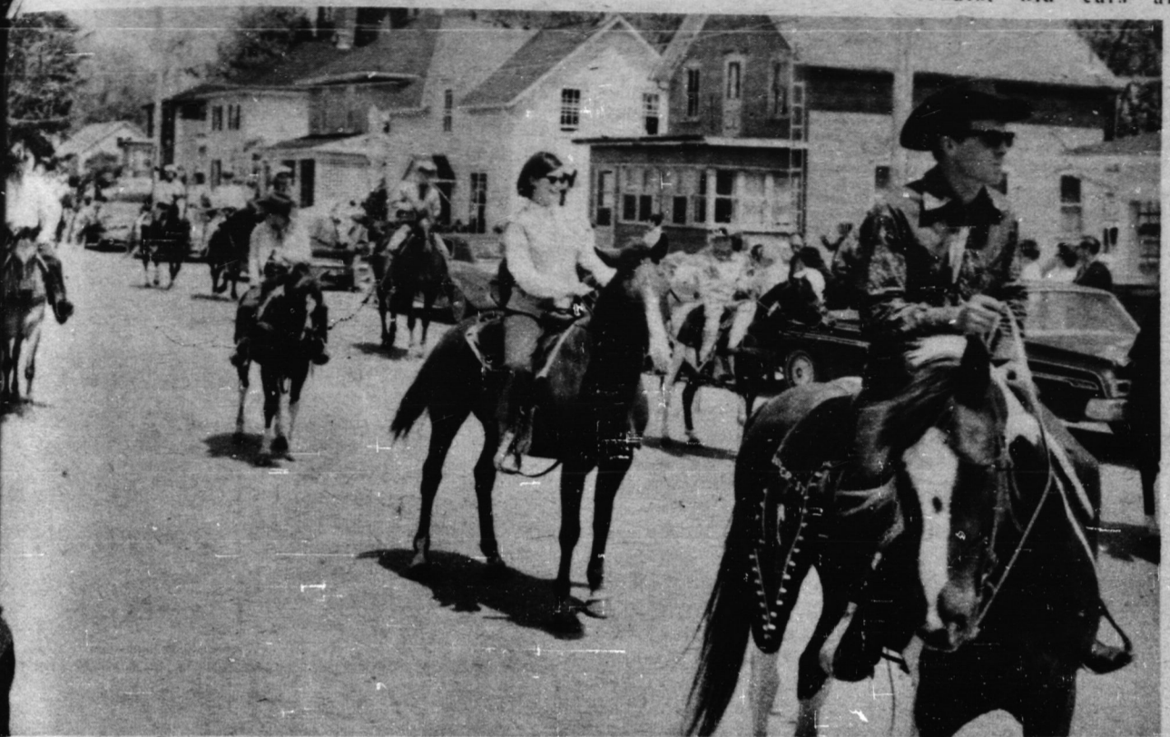
Horses and riders, who took part in the parade, also put on a demonstration at the Community Centre later in the afternoon.

Vol. 92 No. 20 Thursday, May 21, 1970 10c a copy