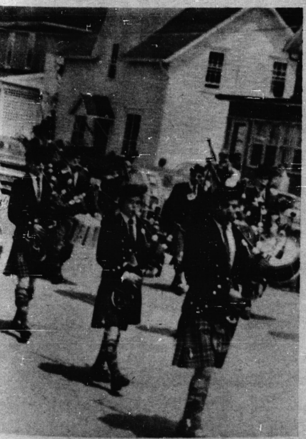
Pipe band was part of the parade in the gala celebrations for Victoria Day in Jarvis Monday.

education as well as supplement subject matter in the schools. In other business the board endorsed a resolution from the York County Board of Education asking for "dwelling unit fees" from new developments and subdivisions. This would mean an additional assessment fees on five percent by property owners of newly developed areas, paid to a municipality, which would be paid to school boards in advance. The fee would mean that anyone purchasing a new home in a new subdivision would be leveled the additional tax. The resolution was sent to Education Minister William Davis and Municipal Affairs Minister Darcy McKeeugh. Caledonia, Dunnville and Canboro, secondary students have produced their own home movies to enter the Ontario Department of Education contest. The films were produced by the students on their own time. They also