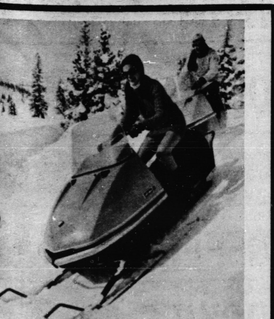
GO ONE BETTER-GO SKI-DOO Complete line of parts, clothing & accessories

NATURAL LOOK EDMONTON (CP) - For a natural look, a noted big game hunter says antlers should be hand rubbed with a light colored shoe polish before mounting. The hand rubbing also slows the rate at which dust will accumulate.