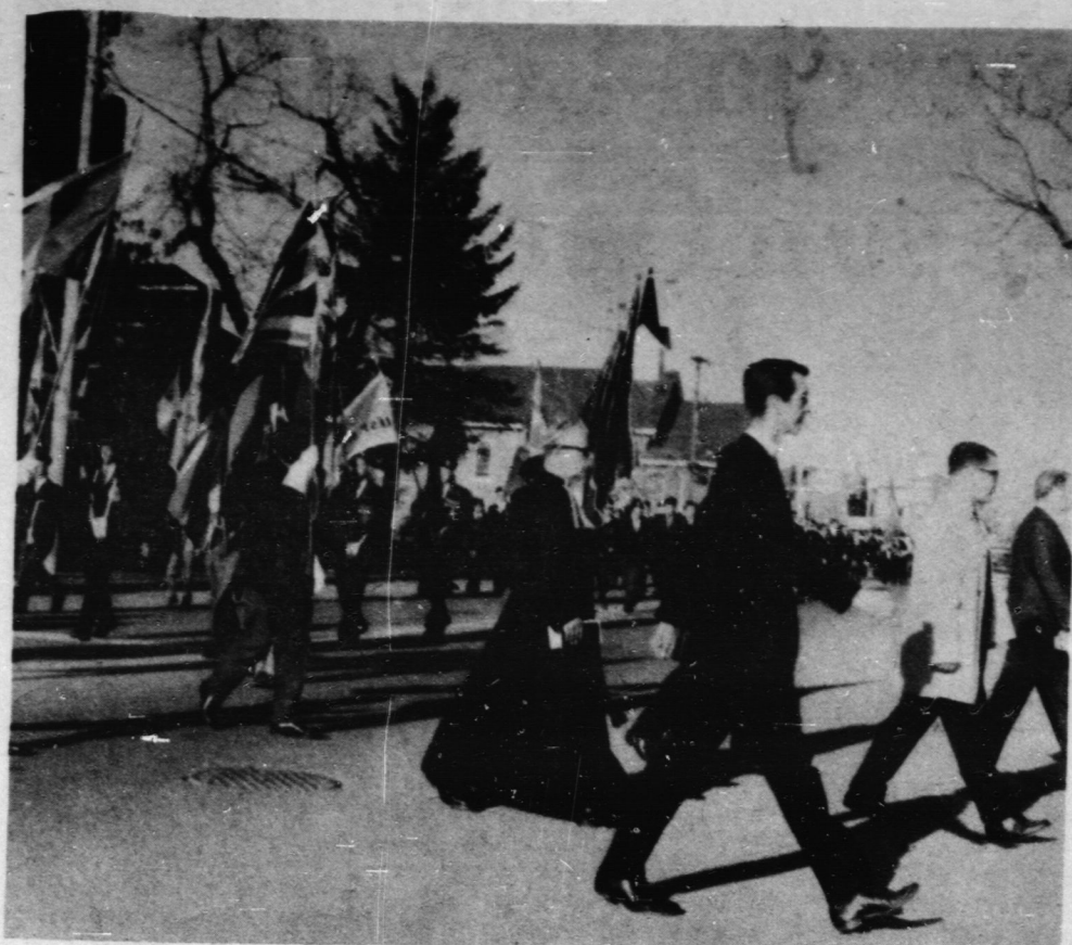
Hagersville Legion in its annual Remembrance Day service had some 100 on parade Sunday. Shown is the parade as it turns to go to the Cenotaph for a wreath laying and Remembrance service.