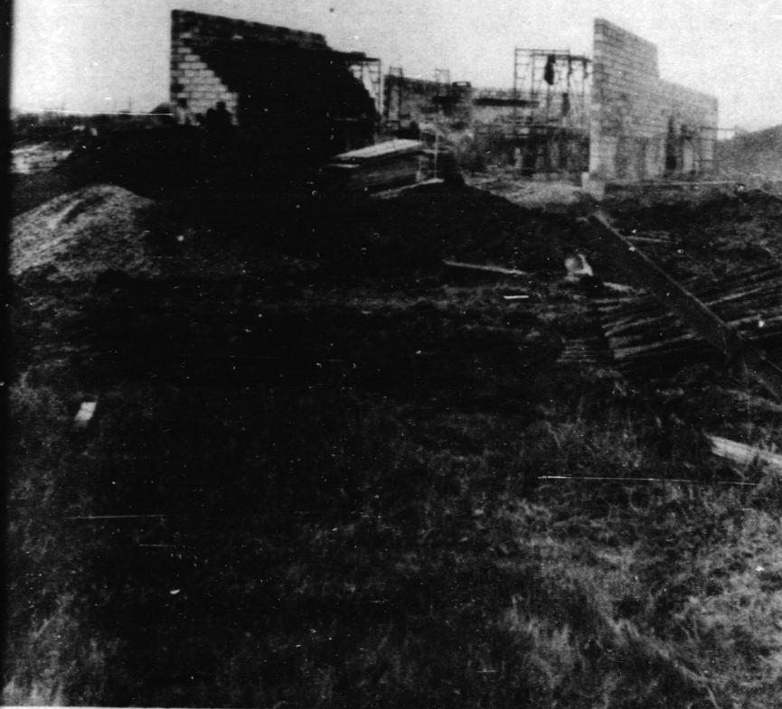
Workmen are making progress on the construction of a new Explorer Inns Ltd. motel on the northeast side of Jarvis.