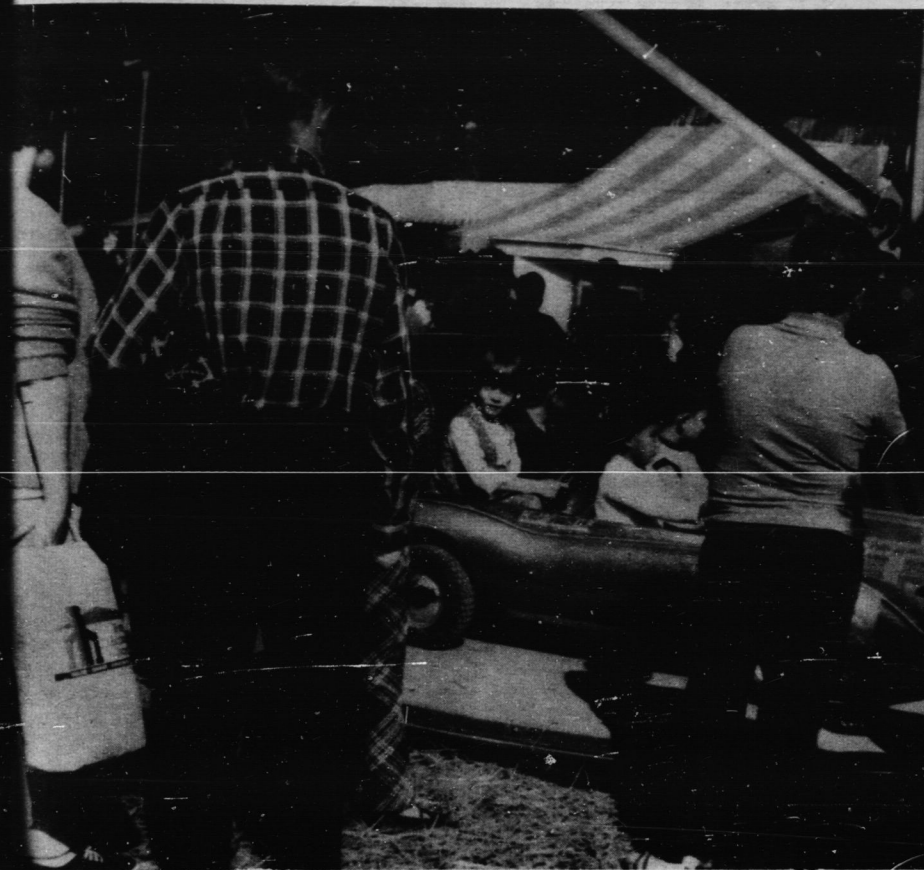
Record crowds jammed the fair grounds Tuesday at the Norfolk County Fair on a beautiful day. Many anxious mothers and fathers waiting to get their offspring.

HAGERSVILLE — The village may be faced with constructing an entirely new fire hall.