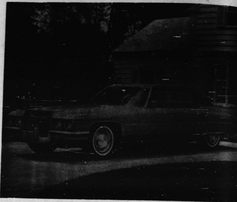
1971 Cadillac Sedan De Ville: The Cadillac for 1971 has Aerodynamic styling featuring its traditional elegance, a new Fleetwood Eldorado convertible plus the accent on riding comfort and added emphasis to safety. Cadillac's new front end look replaces the vertical fender ends with a horizontal wing to emphasize a wider, massive front appearance. The side view of the car highlights the new long look created for 1971 by the flowing tubular shape of the body design, culminating in the foil shape at the rear. Rear styling features a deep draw rear deck that seems almost suspended between rear fenders and a massive deep section rear bumper. A 472-cubic inch engine powers all standard Cadillac models. Shown above is the Cadillac Sedan De Ville for 1971.