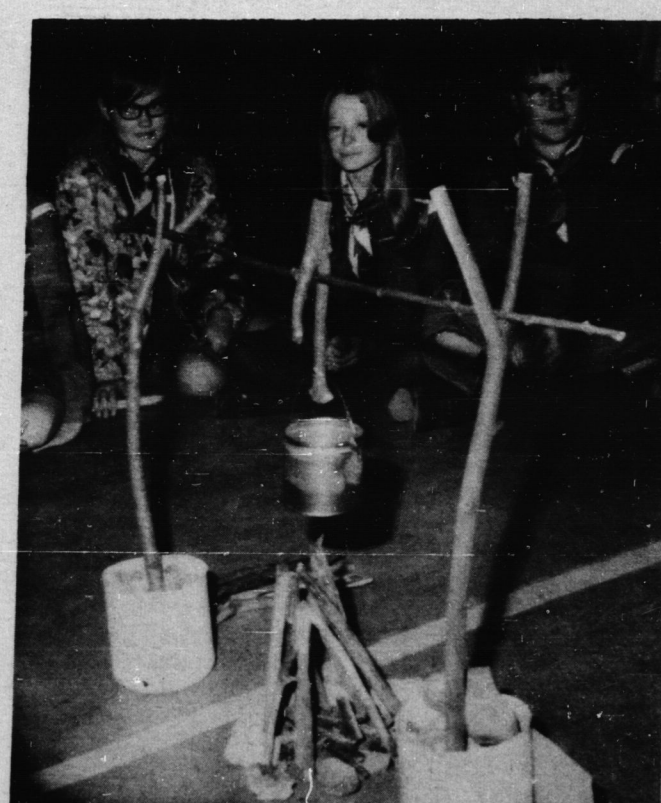
Girl Guides from Selkirk joined Jarvis Guides around a fire for a sing song at the Hagersville Arena on Saturday Oct. 17. The occasion was a Jubilee Celebration for Canada's 60th year of Guiding. See story inside.

Council's resolution stated the health unit is