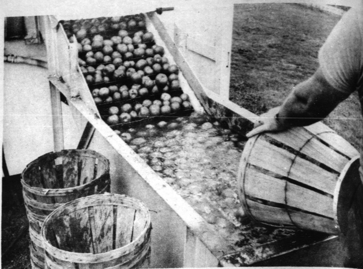
Tomatoes in cleaning hopper at Innes Foods Ltd., Port Rowan.

susceptible to PSE may also require more vitamin E and selenium, both of which improve pork color. Most PSE studies have been carried out on purebreds, says Mr. Bunn. Now that