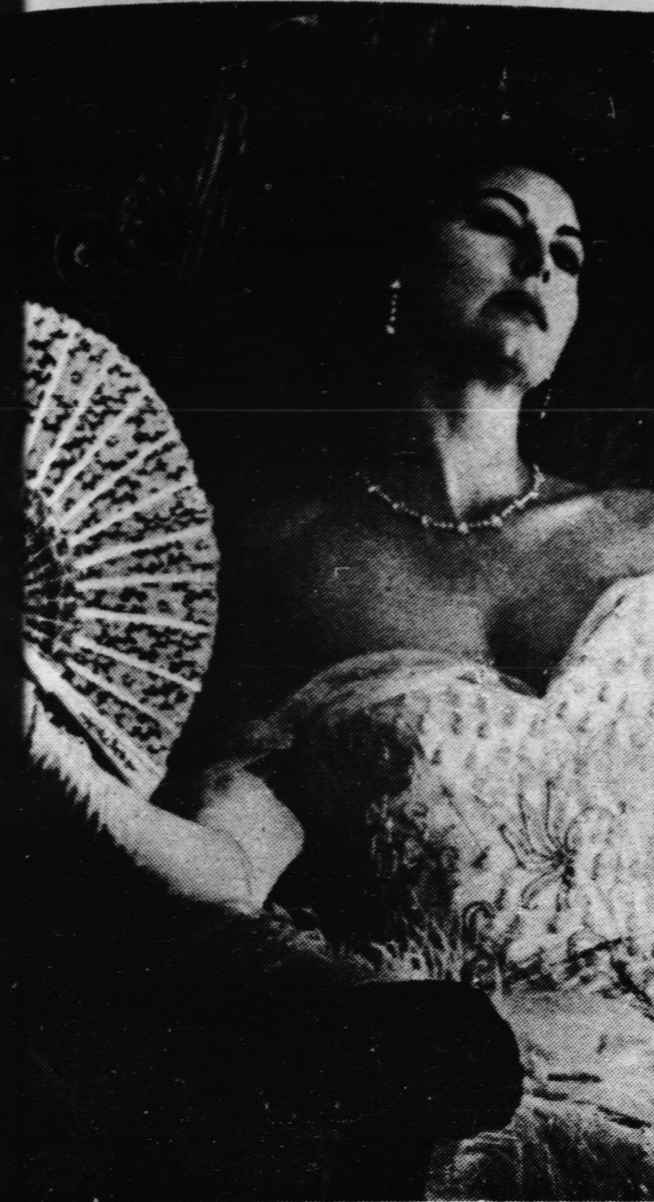
Ava Gardner, movie-tv siren, born Christmas Eve.

SMALL DEPOSIT HOLDS ANY ITEM TIL' CHRISTMAS GIFT CERTIFICATES AVAILABLE FOR THOSE THAT ARE UNDECIDED