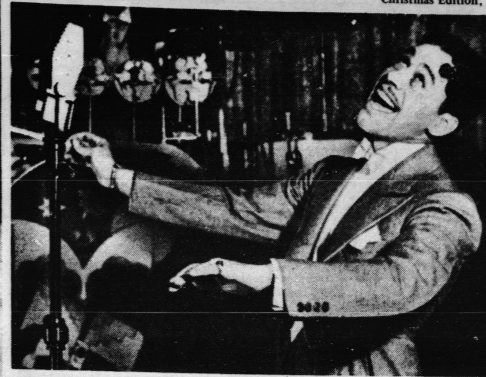
Cab Calloway, heigh-de-ho jazz classicist, has merry Christmas birthday.

CANING EVIL ward off evil, they became part of Christmas, bringing legendary ability to good.