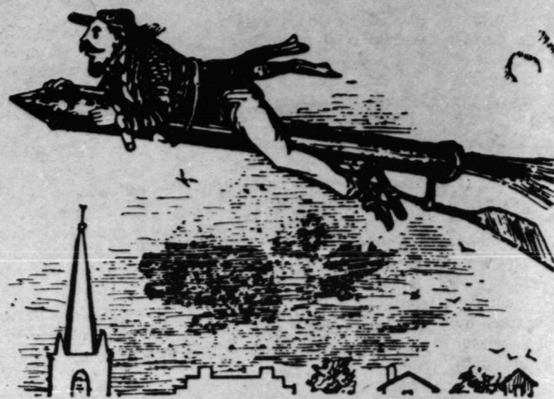
This hot idea was pictured in 1860s, when rocket-guns had been introduced in the whaling industry.

A Frenchman, Jean Blanchard, is credited in reference books with first ascension in the Western hemisphere, at Philadelphia in 1792. However, The Maryland Journal and Baltimore Advertiser of June 24, 1784 related how, the previous day, a 13 year