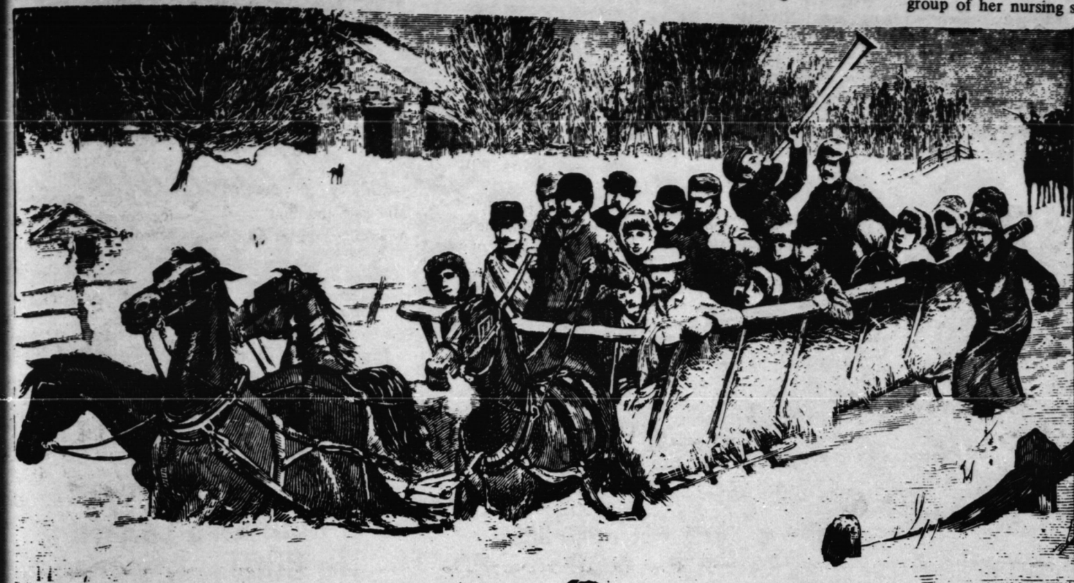
The sleigh-ride was cold month equivalent of hay-ride for lively spirits in olden times, with progress heralded resoundingly by horn, and chaperones following (extreme right) discreetly.

Christmas should be a happy time for children. Yet, for many Christmas is a time of sadness. Perhaps it's because their dreams haven't come true. They feel that maybe Christmas is only for others, not for them. But their dreams can come true — for The Salvation Army, through you, can bring a measure of happiness to less fortunate children.