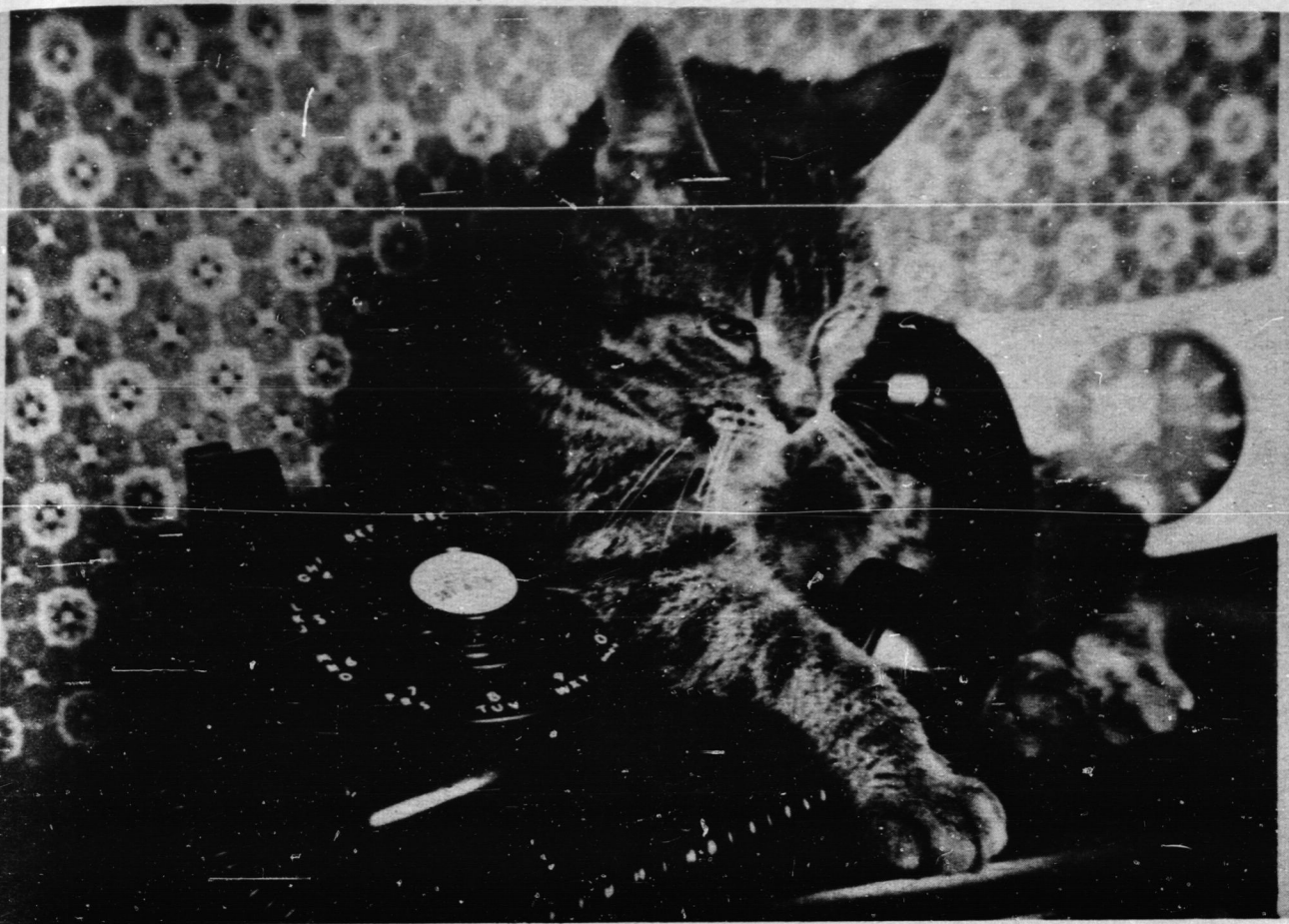
This is a smart cat. He has just completed a phone call for some items from local merchants. He has discovered their prices are just as good as those in the city.

Vol. 93 No. 2 Thursday, January 14, 1971 10c a copy