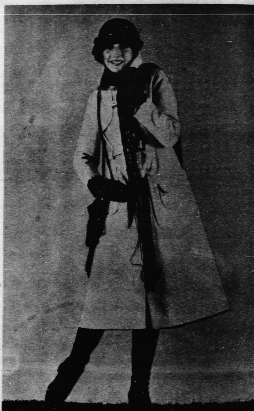
A Canadian fashion, this canvas midi coat with Borg trim, worn with hand crocheted accessories, is typical of the exciting new fashions being manufactured in Canada with the encouragement of Fashion Canada, a promotional program started just over one year ago by the Federal Department of Industry, Trade and Commerce.

Most garden supply centers have a wide selection of pesticides for home use. But always remember: read the label first and follow the directions carefully.