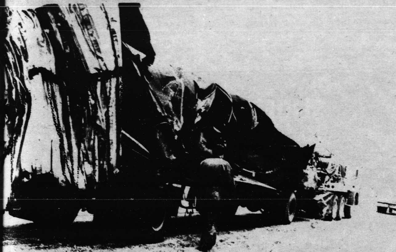
This was all that was left of a tractor and trailer unit after it blew a front tire and crashed into three trees four miles east of Jarvis, Friday.