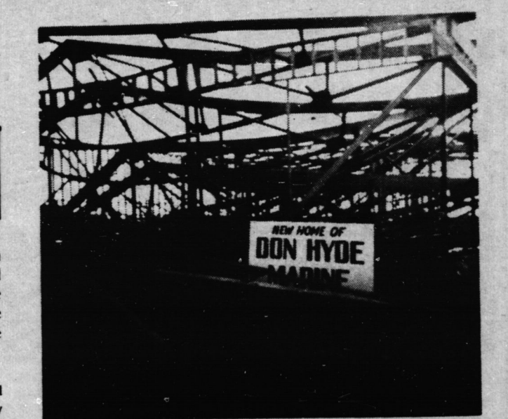
Construction of a new building for the Don Hyde Marina took a beating from the wind last week. Shown is the twisted lumber that was left after the storm went through.

Prize money was: First—$5; Second—$3, and Third—$2.