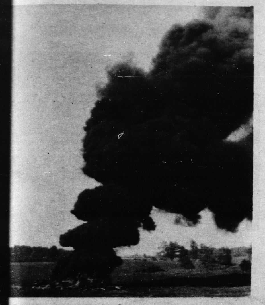
pollution of the airways. This pile of trash was burning Tuesday on the south Highway 3 near Renton. Old tires, old wood and other materials were the fuel flames and smoke.

No. 22 Thursday, June 3, 1971 10c a copy