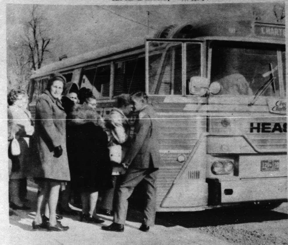
Members of the Legion Auxiliary, Branch 164 in Hagersville, leave for a day's outing in Toronto aboard the newly-licensed Heaslip Motors Ltd., charter bus service. The group took in the famous Toronto Ice Capades during the visit.