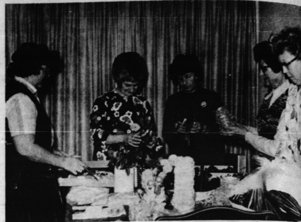
These Hagersville mothers of members of the Hagersville Secondary School band were busy this week setting up the "Band-Aid Bazaar" to raise money for an overseas tour by the group next summer. The bazaar was held in the school cafeteria Wednesday.