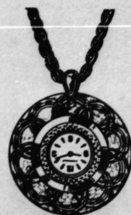
CARAVELLE MODEL 4157 An adorable round pendant watch. Available in yellow or white. $27.95

PLUMBING - HEATING - ELECTRIC Jarvis, Ont.