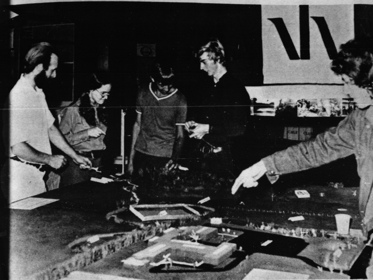
Norfolk County fair is in full swing this week with an attendance objective of 108,000 to beat last year's mark by 8,000 people. Above a high school exhibit gets the finishing touches by teachers and students.