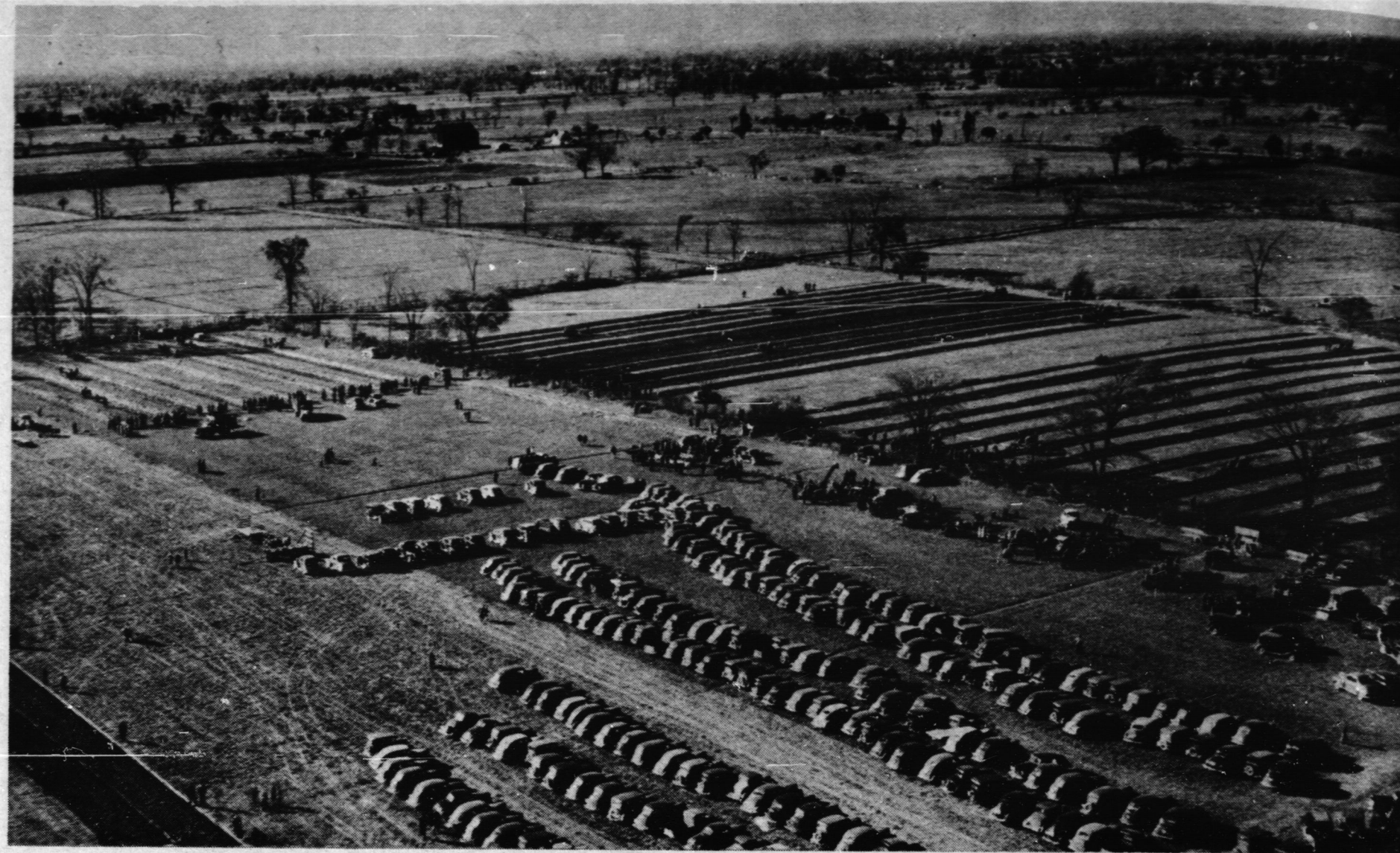
This scene, from a plowing match event in the mid-thirties in Haldimand County, was revived recently from the files of the Ontario Department of Agriculture and Food, in Cayuga. The modern version of the plowing match and machinery

demonstration had its beginning in 1926, according to Ontario Plowmen's Association records.