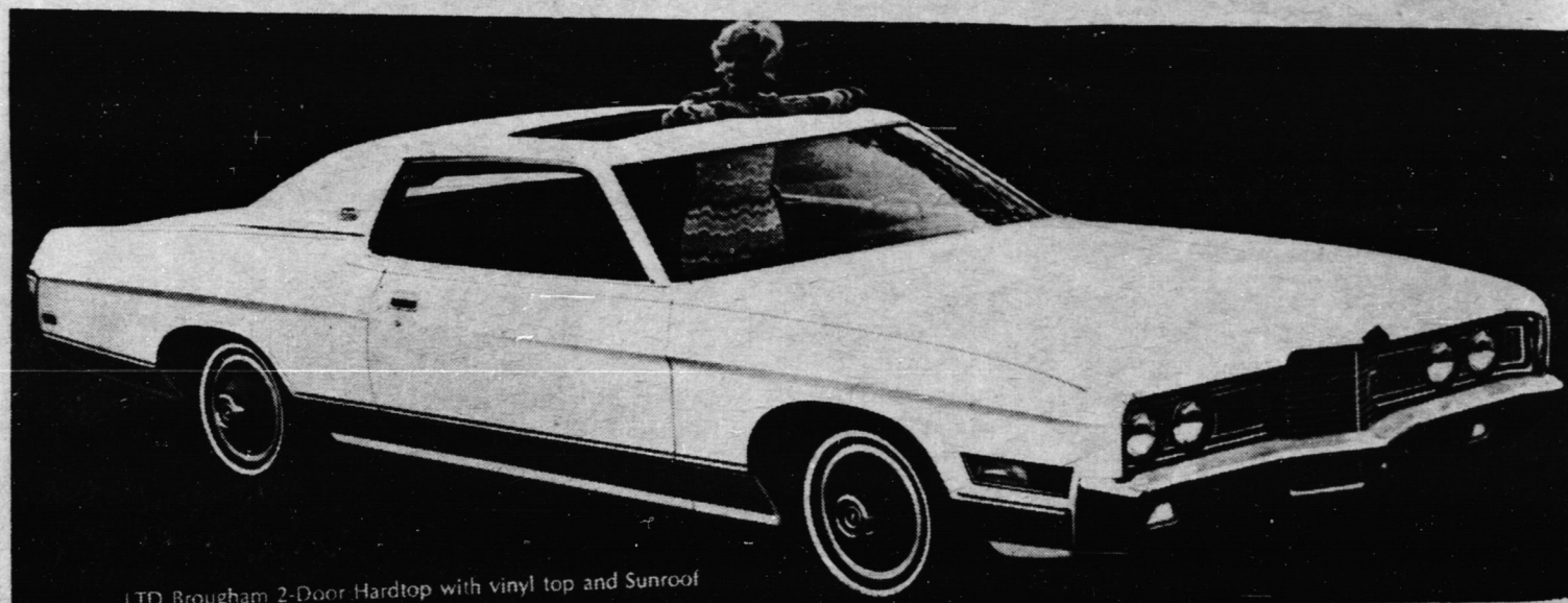
LTD Brougham 2-Door Hardtop with vinyl top and Sunroof

Quiet plus. Ford '72 ...gives you better ideas