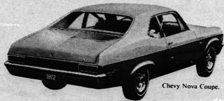
Chevy Nova Coupe.