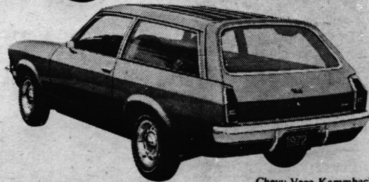
Chevy Vega Kamback Wagon.