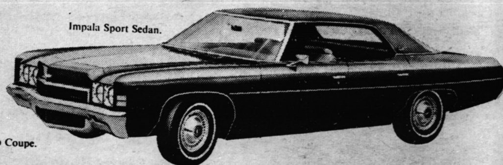
Impala Sport Sedan.