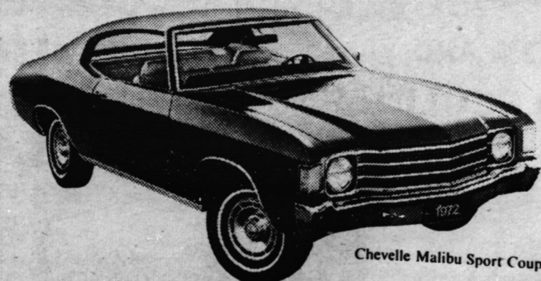
Chevy Vega Kamback Wagon.