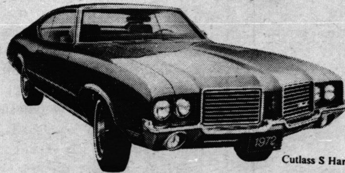
Chevelle Malibu Sport Coupe.