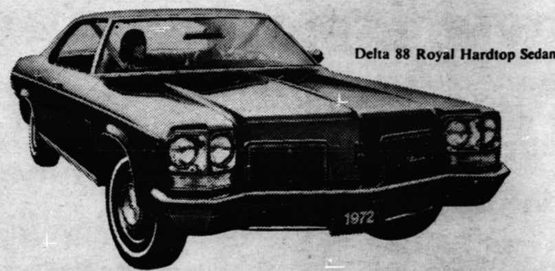
Delta 88 Royal Hardtop Sedan.