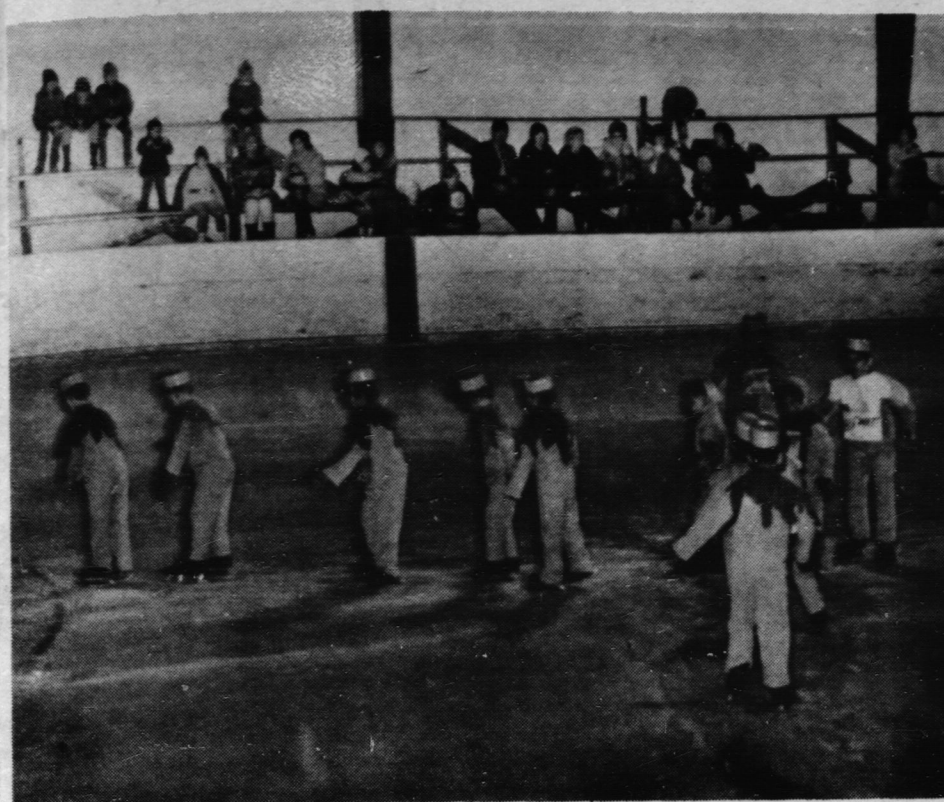
The "paint cans" in their colorful costumes helped the toymaker fix his toys during their performance as part of Ice Revue '72 by the Hagersville Figure Skating Club.