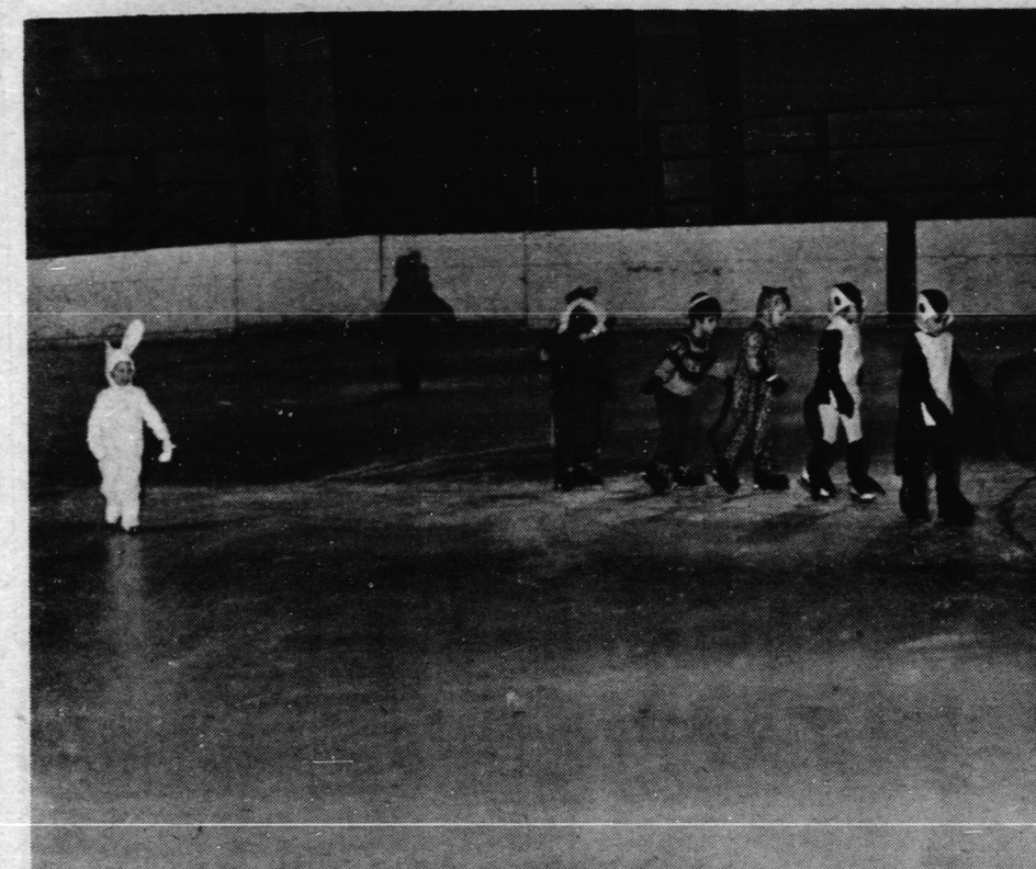
This little "rabbit" decided following the rest of the "stuffed animals" was not for him and he struck off on his own. The skaters were among the youngest, and most fun to watch, at the annual Hagersville Ice Skating Carnival.