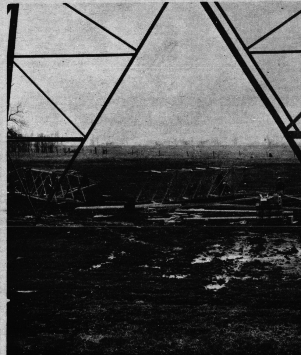
Ontario Hydro is currently building its second 230 KV line from Nanticoke to Middleport. Workers have been on the project for the past three weeks. The towers are built in sections then lifted and bolted together to form the 150-foot towers.