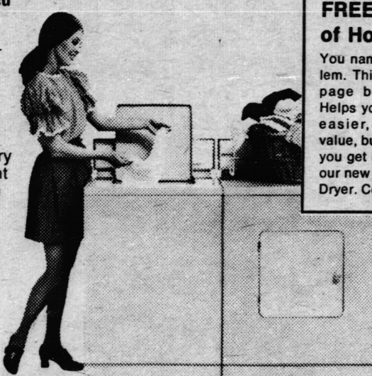
The Maytag Fabric-Matic pair, Models A407 automatic washer and D407 dryer.

Just set the dial and relax. These new Maytag Problem-Solvers wash and dry practically anything just right... automatically! Best part is, the new Maytag Fabric-Matic Washer and Dryer COST LESS than other Maytag pairs with automatic all-fabric versatility. Come in and see them today!