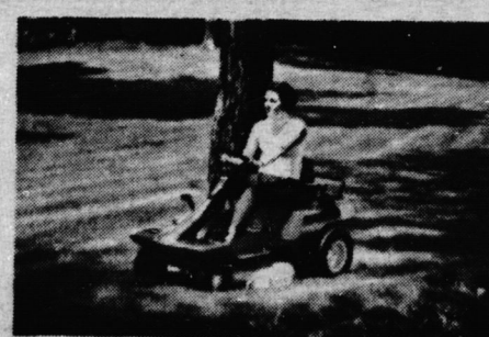
8 H.P. Emperor II