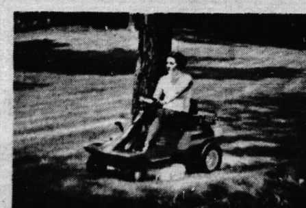
8 H.P. Emperor II

HOBBS' MEN'S WEAR 35 King St. W. HAGERSVILLE