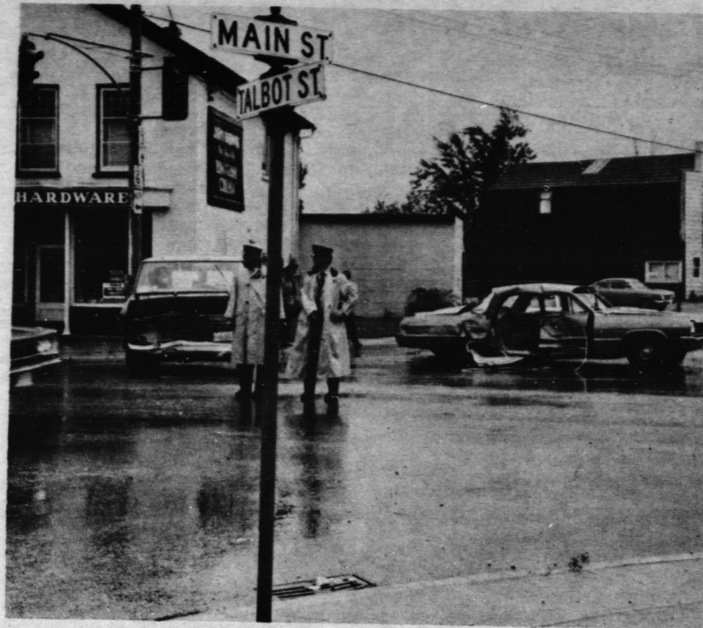
Three persons were injured in this three-vehicle crash Monday afternoon at the intersection of Highways 3 and 6. The injured were treated and released from West Haldimand General Hospital. Damage totalled $2,750.