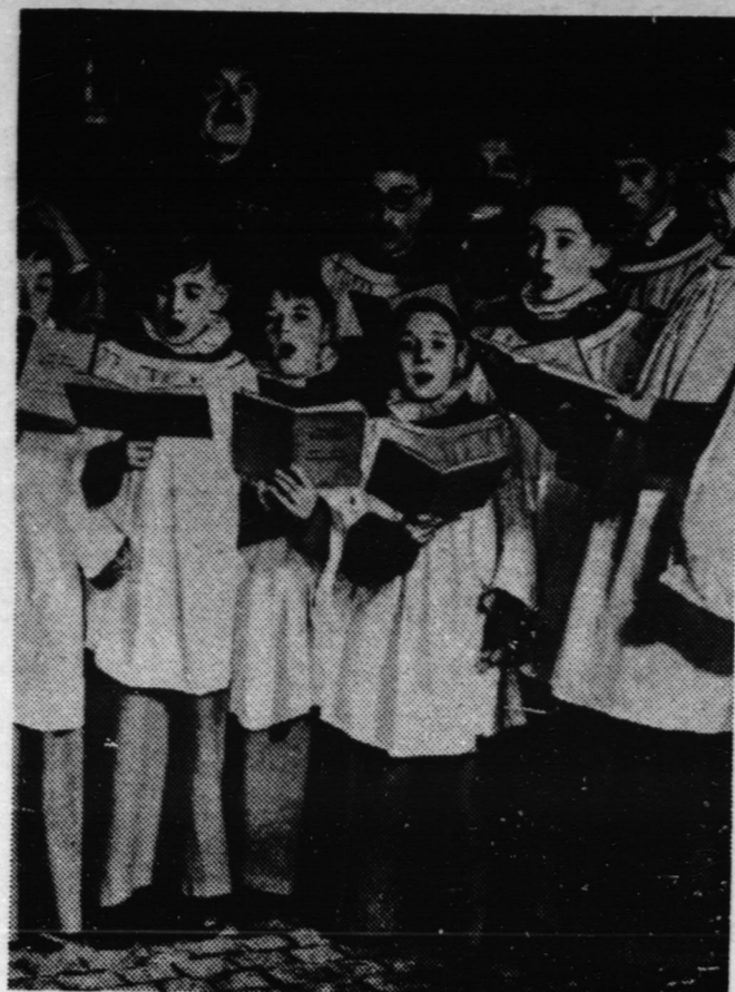
Modern day carolers (above), are photographed singing at the Tower of London, along with the famous Beefeaters. From the New Book of Knowledge; photo, by the British Travel Association.

SKI-DOO the machine that changed winter ... has changed