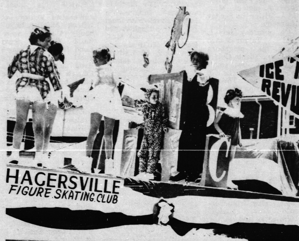
This float sponsored by the Hagersville Figure Skating Club captured first prize as the best representative in the float category. The parade was a highlight of the Hagersville July 1 celebration. (Staff Photo).