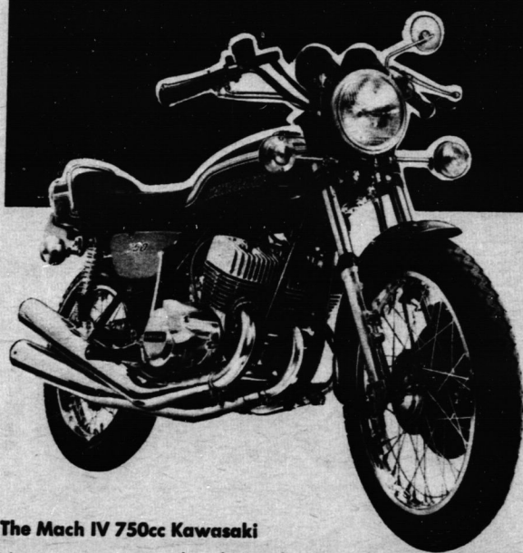
The Mach IV 750cc Kawasaki

It's easy to stay ahead on the Kawasaki 750cc Mach IV, the world's fastest production motorcycle. It's the ultimate in power and performance. Get the details on the only bike that can cover the SS 1/4 mile in 12.0 flat (and this is no misprint) ... we really do mean 12.0 flat.