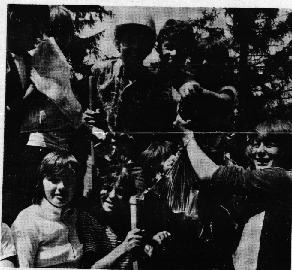
Last Friday the students at the Jarvis Public School made a blitz of the village collecting several piles of garbage, which were brought back to the school and trucked away. The project was part of a week of study at the school on the environment and pollution problems.