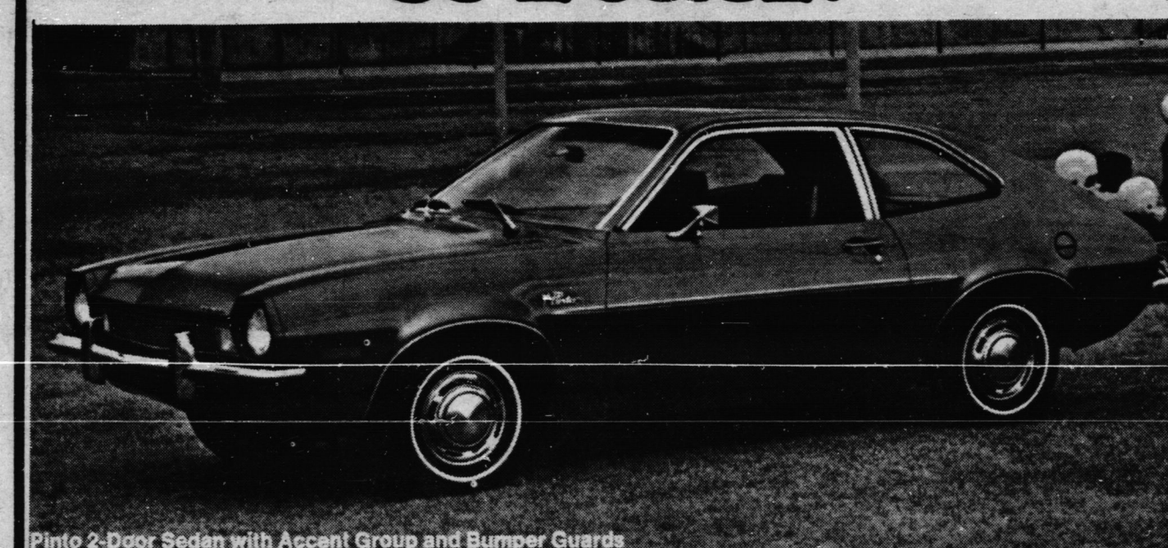
Pinto 2-Door Sedan with Accent Group and Bumper Guards