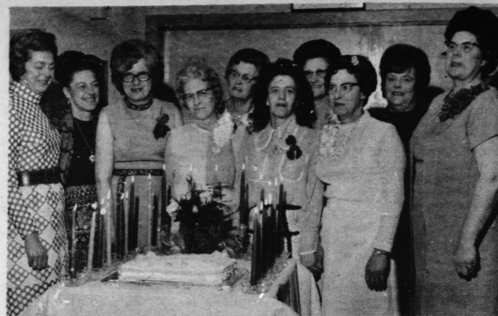
Past presidents of the Ladies Auxiliary, Hagersville Legion, took turns in lighting the 20 candles on the birthday cake marking the 20th anniversary celebration of the auxiliary in Hagersville on Saturday night.