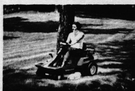
8 H.P. Emperor II