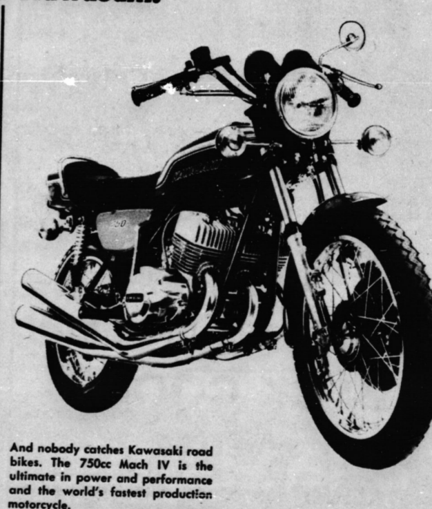
And nobody catches Kawasaki road bikes. The 750cc Mach IV is the ultimate in power and performance and the world's fastest production motorcycle.

Make sure you come out ahead... come in and see our complete Kawasaki line... we have everything from mini's to the maxi 750cc Mach IV.