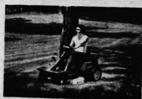
8 H.P. Emperor II

Service is our Specialty Quality is what we sell - 768-3404